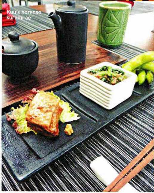
Kuu's horensō kurumi ae

There's a little bit of Kyoto in Sanur. At Kuu , small plates and light bites brimming with innovative and classic Japanese flavours are the main event; while polite service and a display kitchen form the delicate trimmings. For lunch, this izakaya offers familiar fare: bento boxes, noodles and rice bowls. During dinner, otsumami like Goma Dofu (Rp 30,000) and hand-cut lotus chips go well with sips of their fine sake, while nigiri sushi platters and cooked items make hearty meals. Maya Sanur Resort & Spa, Jalan Danau Tamblingan No. 89M, Batujimbar, Sanur 80228. Tel: +62 361 849 7800.