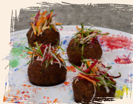
potatoes in Delhi 35k++