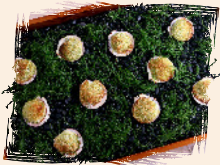
baked scallop 40k++