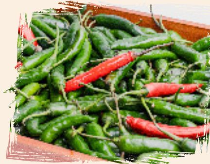
chili satay 45k++