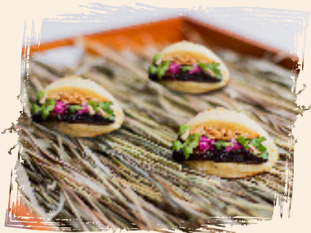
roasted pork bun 60k++