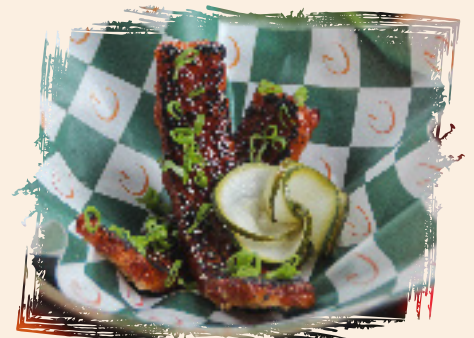
almost bbq ribs 40k++