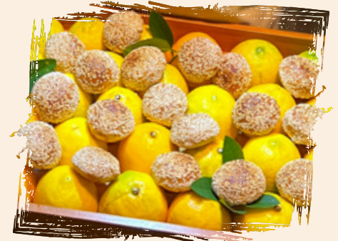
mini lobster roll 95k++