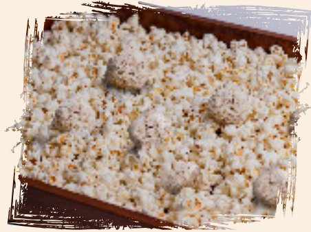
popcorn chicken 35k++