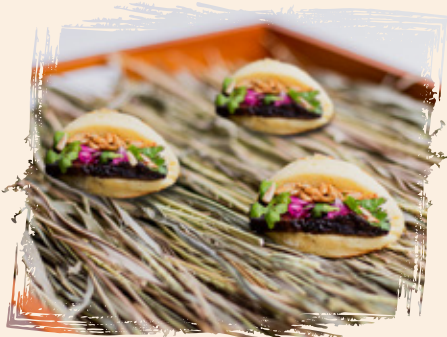
roasted pork bun 70k++