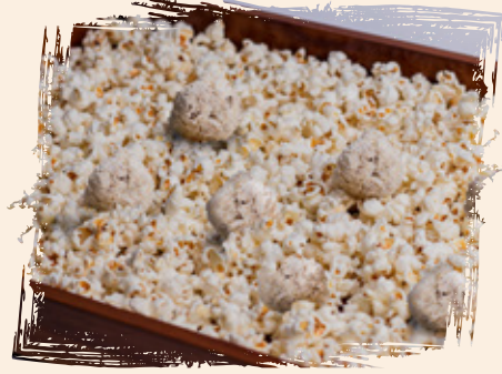
popcorn chicken 45k++