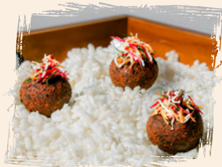
potatoes in Delhi 40k++