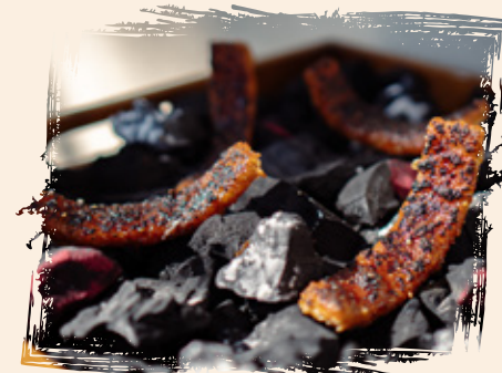
almost bbq ribs 45k++