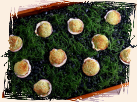
baked scallop 45k++