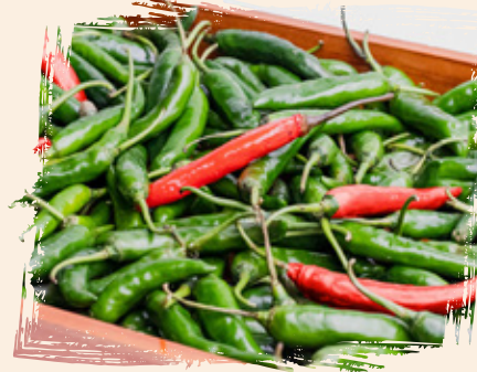
chili satay 50k++