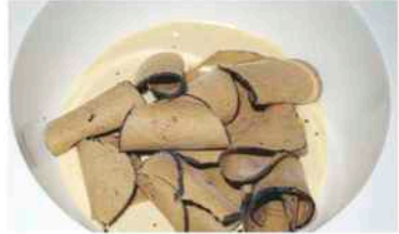
A dish called 'Sharpening Our Pencil.'