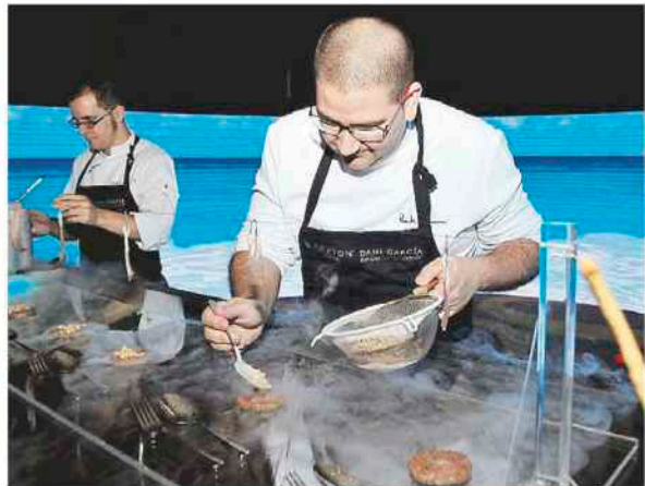
Chef Dani Garcia garnishes the tuna tartar with nitro-popcorn of Yuzu.