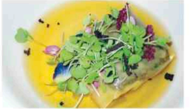
Oxtail ravioli with sherry-flavored consome.

(This ultimate gastronomic experience was supported by media partners including ABS-CBN News Channel, CNN Philippines, Chinoy TV, 2nd Avenue, The Philippine Star, Business World, Easy Rock 96.3, Crossover 105.1 and RJ100. For dining inquiries at New World Hotel Manila Bay, call 252-6888 or visit newworldhotels.com .)