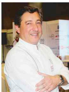
Chef Joan Roca.